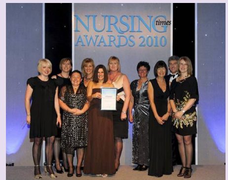
▲ The Maternity Team being presented with their Nursing Times Awards 2010.

experience, reduces recovery time and shortens their length of stay.