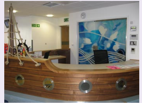
▲ The Galleon Ship Nurses Station

of services to the children of Blackpool and the Fylde coast. We have a team of dynamic staff who are very patient focussed offering better care and value to all who walk through our doors."