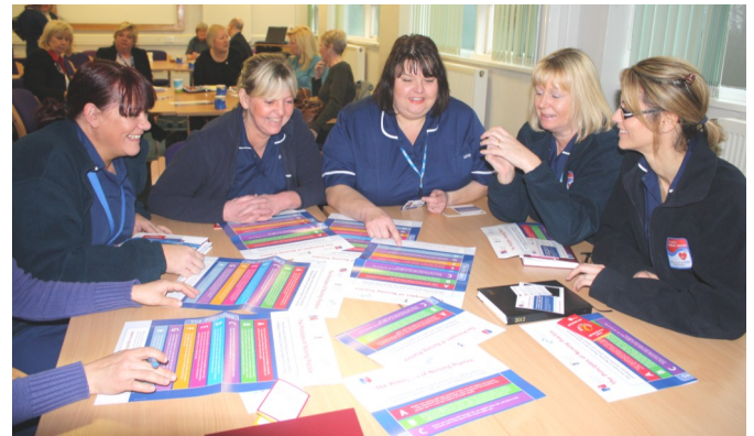
Nursing staff enjoy the RCN workshop.

For the latest updates on mandatory training see the weekly countdown newsletter every Monday.