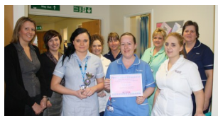
Ward 24 staff receive their trophy.

THE latest 'Outstanding Contribution to the Stop Smoking in Secondary Care' trophy was awarded to Ward 24, to recognise their efforts in supporting patients who smoke and offering them referrals to the Stop Smoking Treatment Service. Ward staff have been given the opportunity to attend training and encouraged to provide excellent support for patients who smoke. Many patients admitted to Ward 24 benefit from stopping smoking as they are suffering from smoking-related diseases. The ward marked a milestone in the Stop Smoking Treatment Service when they referred the 1000 th patient. They have so far referred 126 patients.