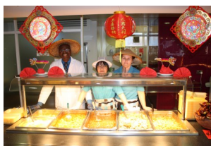
Oliver's staff don their Chinese attire.

OLIVER'S welcomed in the Chinese New Year last week with a special themed menu. The Chinese year of the Water Dragon was marked with Chinese lanterns and cultural decorations hung from the roof of the restaurant and an authentic Chinese banquet was served to staff by members of the catering team dressed in distinctive Asian bamboo hats.