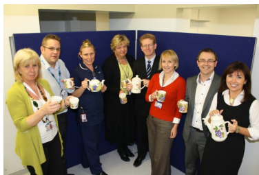
The End of Life care team make an appeal for tea sets.