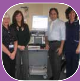
Urodynamics Satisfaction Survey