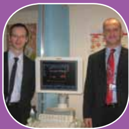
Developments in Stroke Services