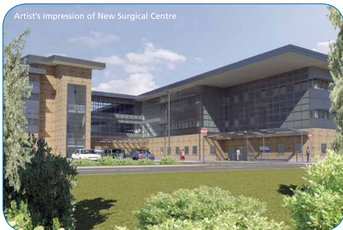
Artist's impression of New Surgical Centre

Work on the Surgical Centre is due to begin shortly and should be completed in April 2011 and the Urgent Care Centre is set to be started this year and be finished in 2010.