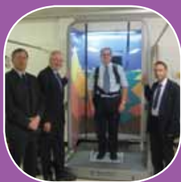
Launch of new Balance Clinic